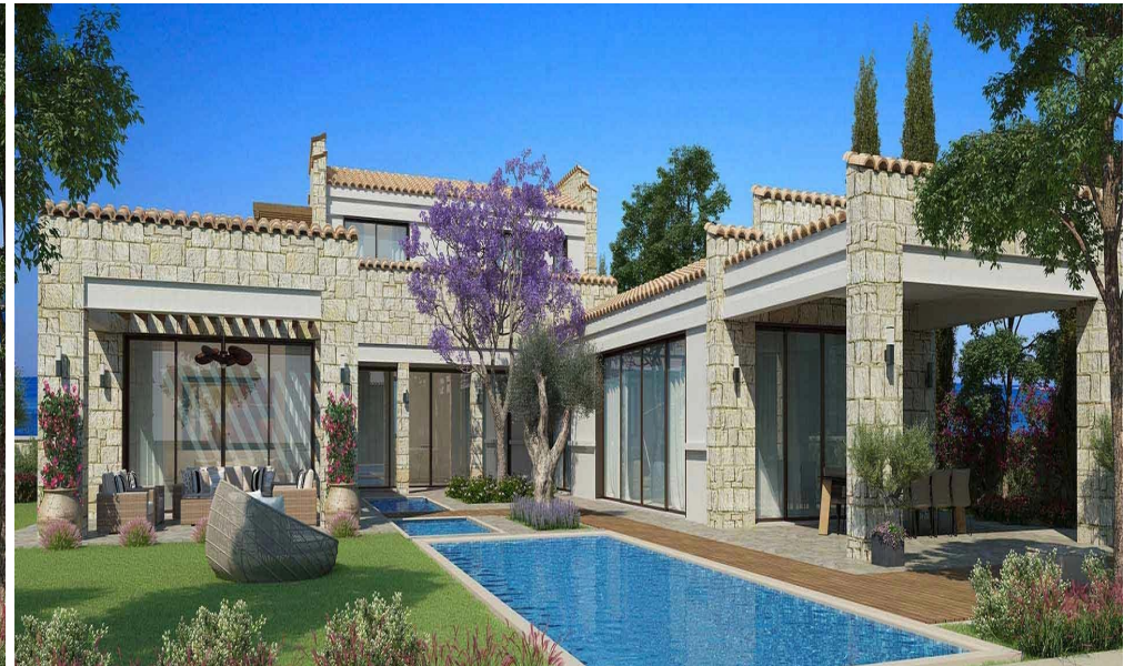
3 BEDROOM VILLA