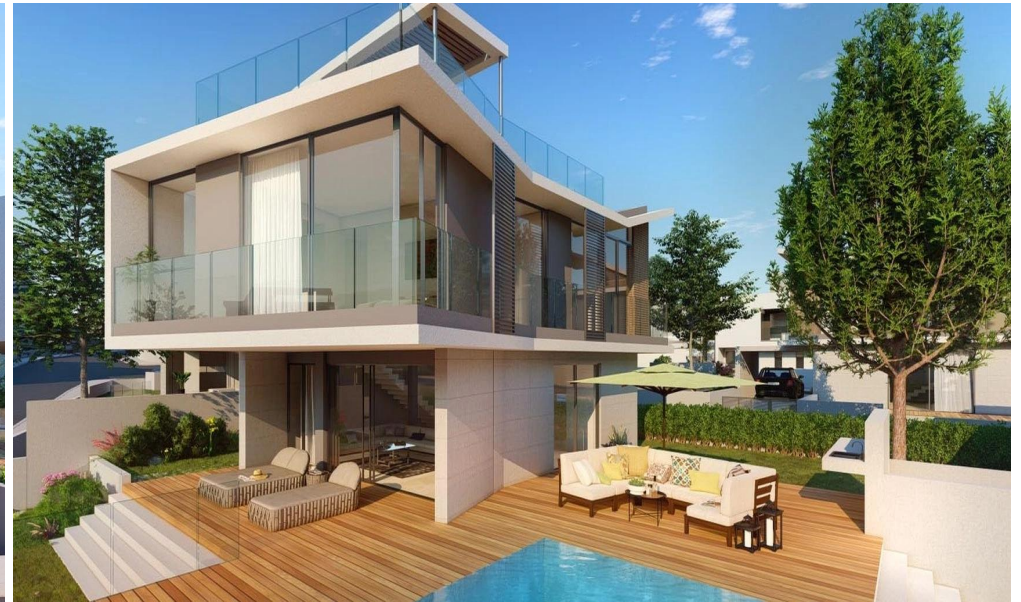
3 BEDROOM VILLA