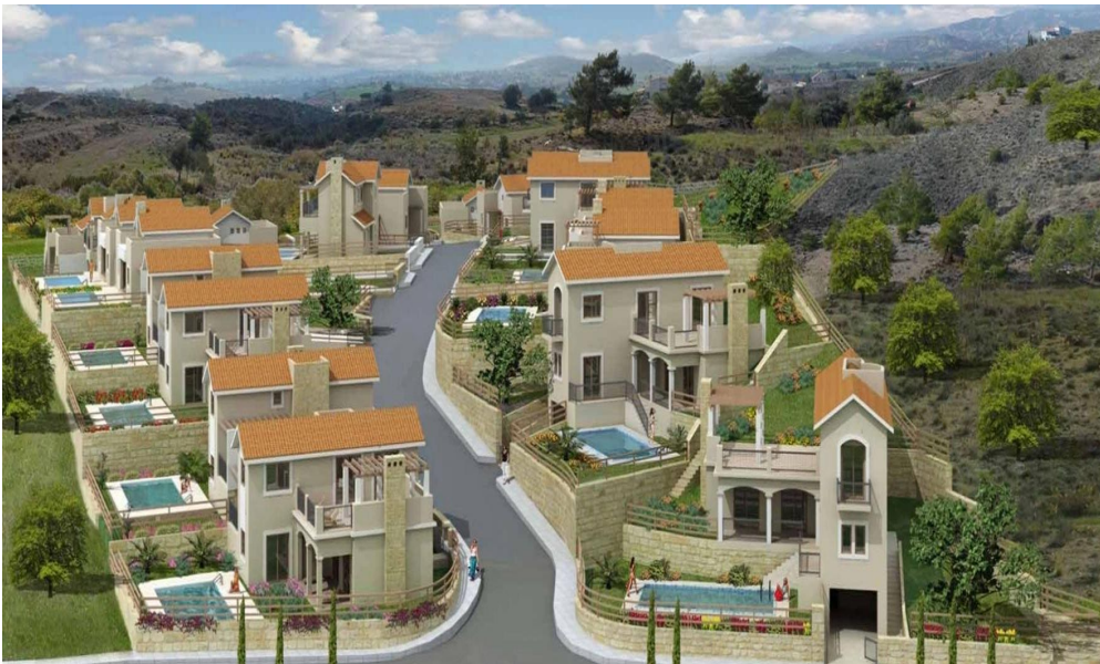
3 BEDROOM VILLA