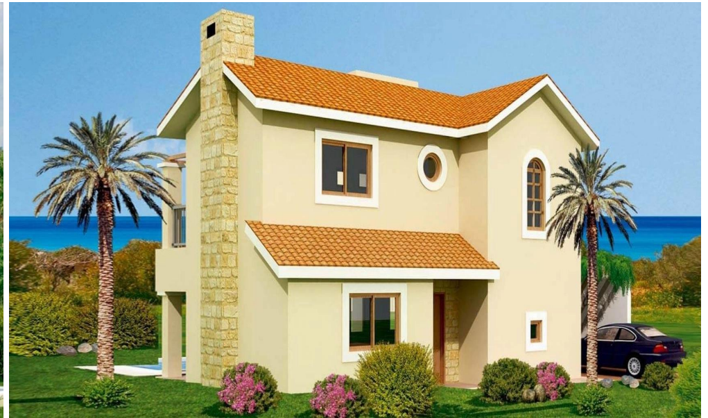
2 BEDROOM VILLA