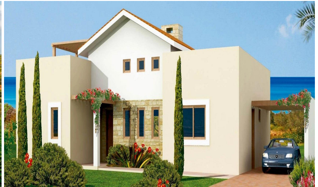
VILLA ADONIS - VILLA16