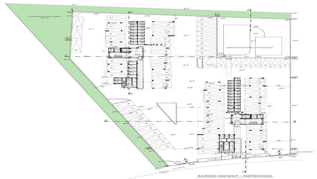
ΚΑΤΩΦΙ ΙΣΟΓΕΙΟΥ - ΧΩΡΟΤΑΞΙΚΟ