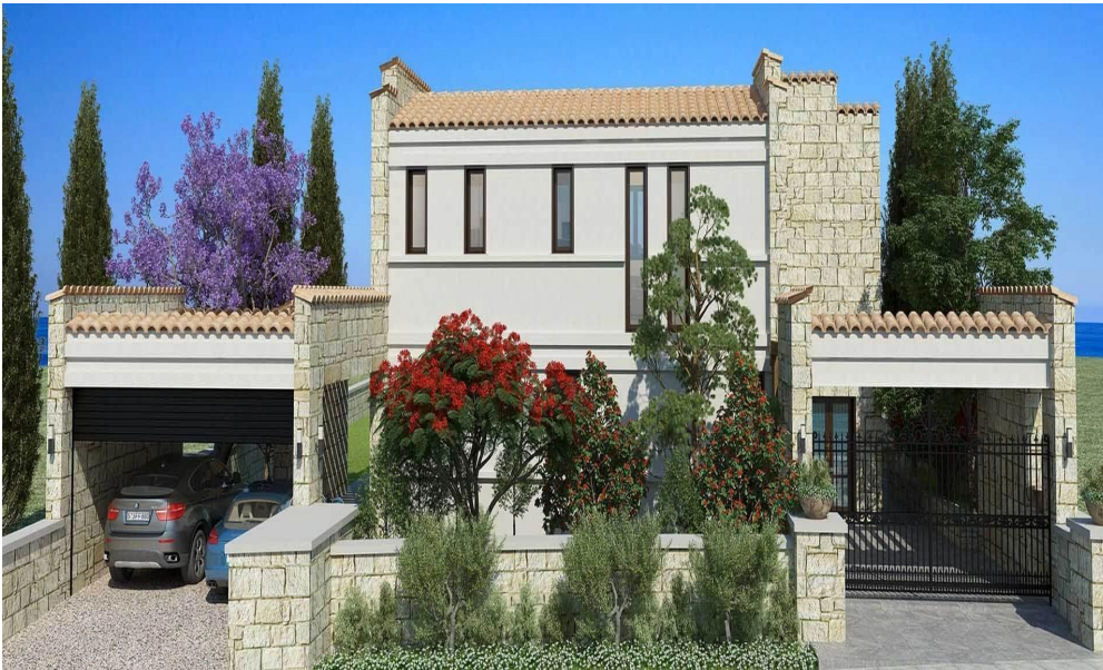
3 BEDROOM VILLA