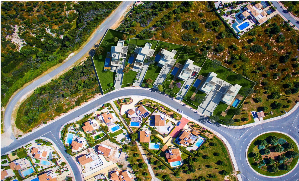
4 BEDROOM VILLA