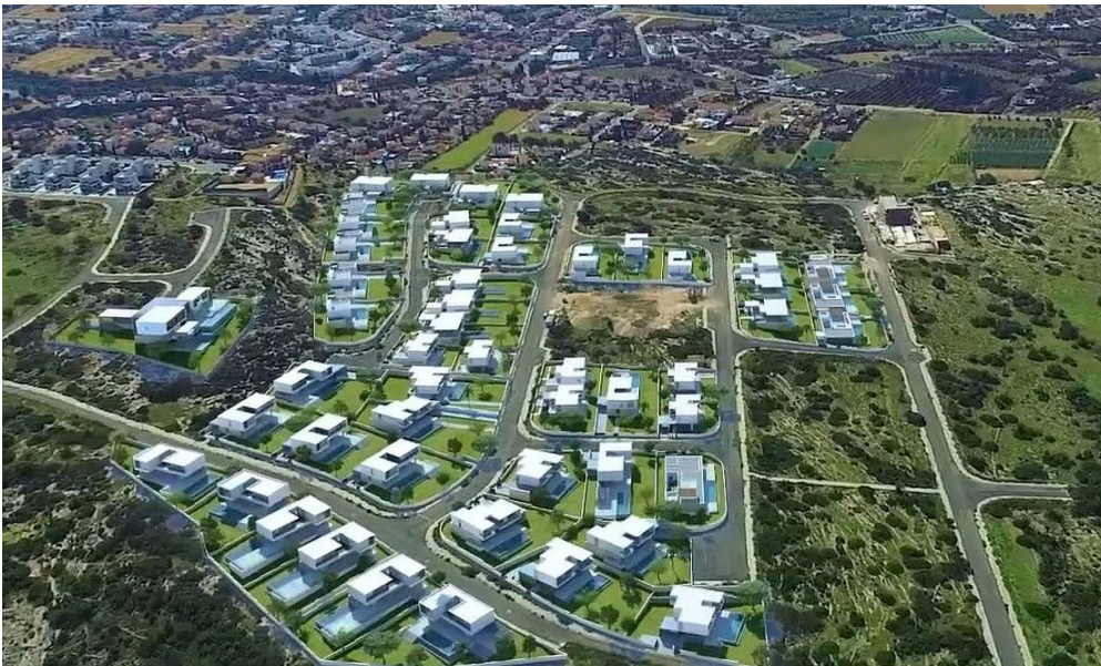
3 BEDROOM VILLA