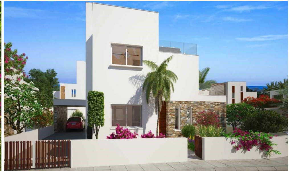
4 BEDROOM VILLA