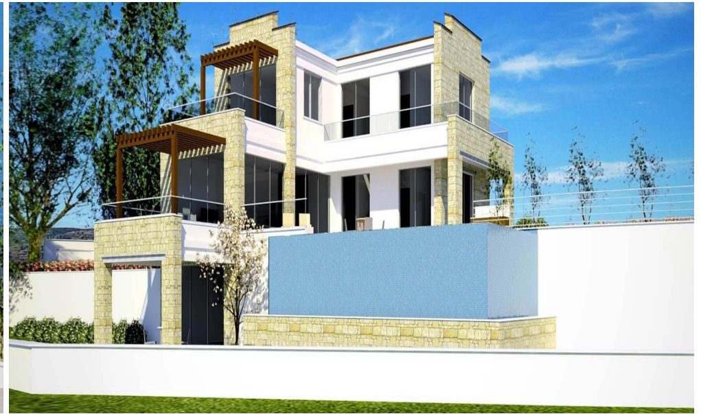
7 BEDROOM VILLA