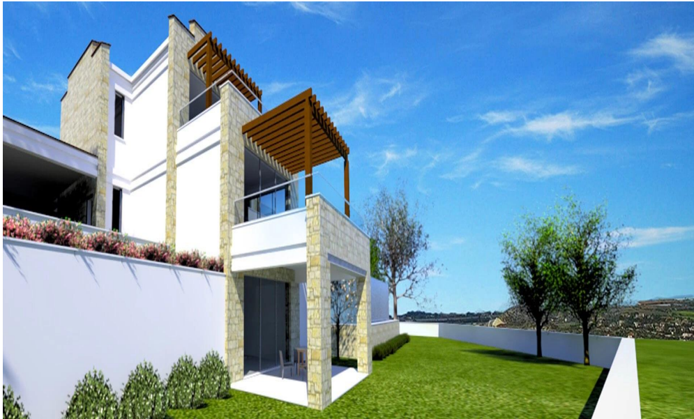
7 BEDROOM VILLA