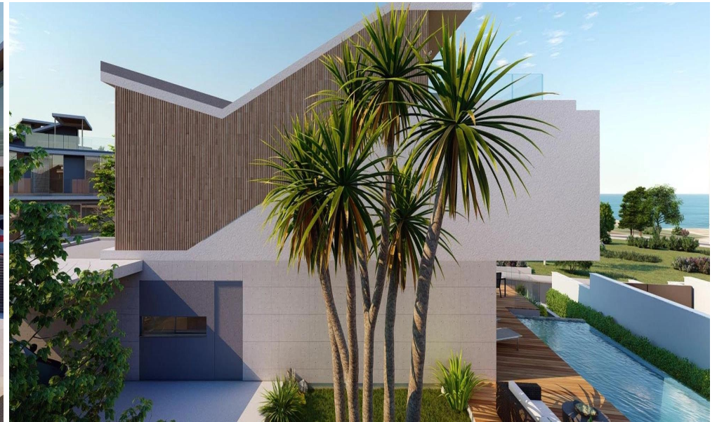
4 BEDROOM VILLA