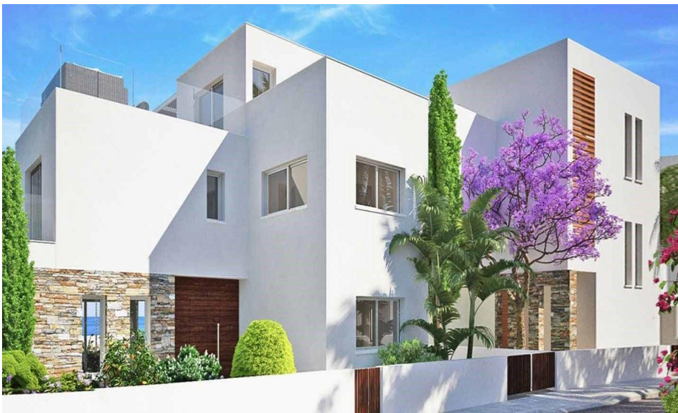
4 BEDROOM VILLA