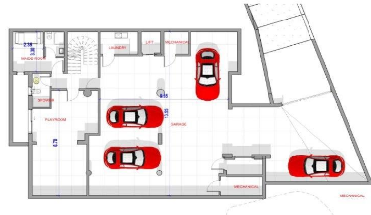
PRELIMINARY LOWER GROUND FLOOR