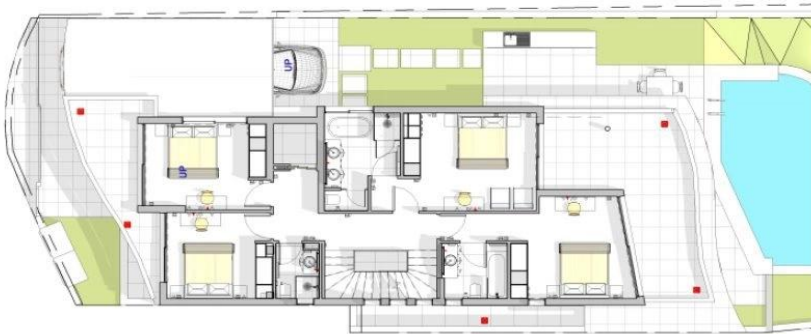
PRELIMINARY FIRST FLOOR