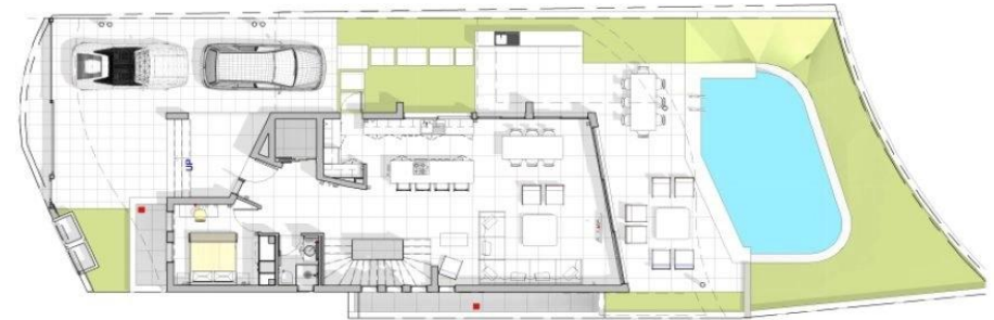
PRELIMINARY GROUND FLOOR