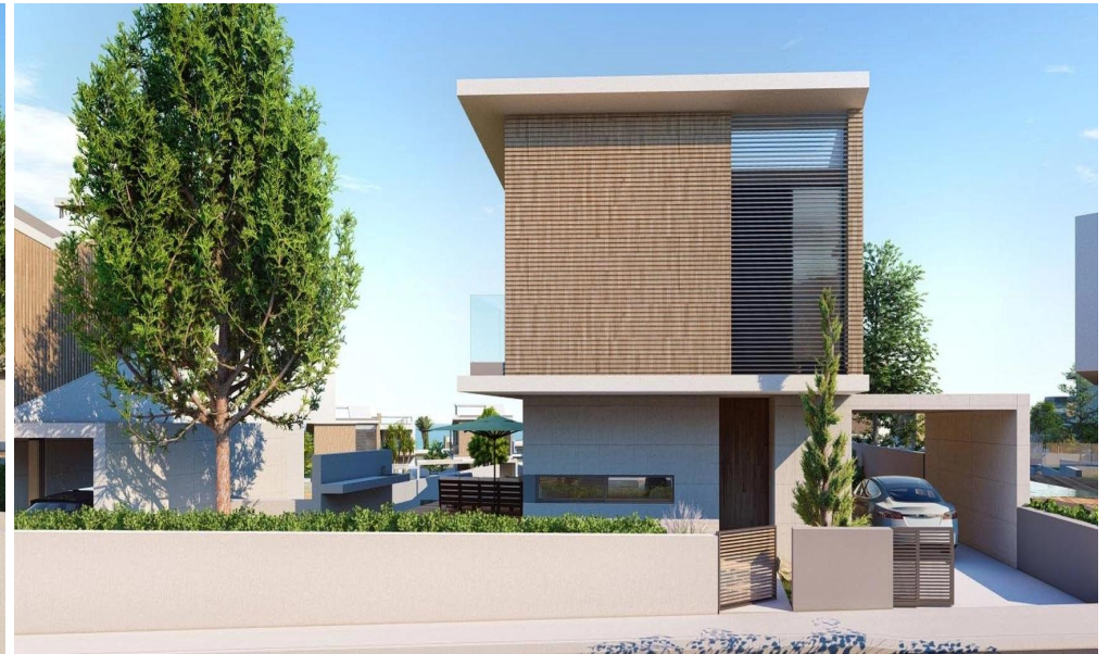
3 BEDROOM VILLA