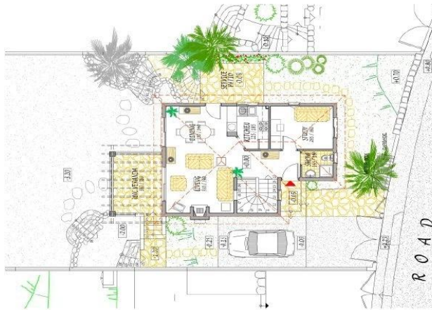
PRELIMINARY GROUND FLOOR