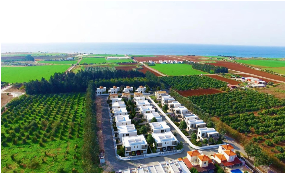
VILLAS 27,31 AND 32 TYPE: NEREID | 3 BEDROOM