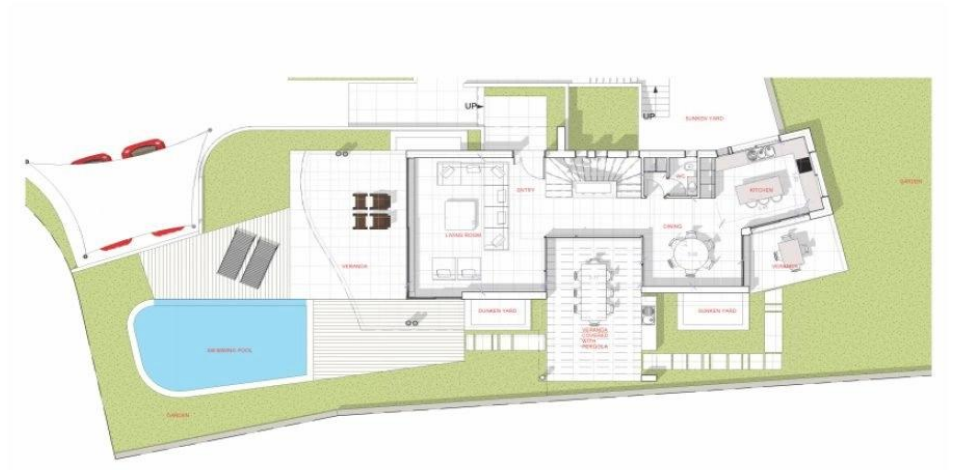
PRELIMINARY GROUND FLOOR