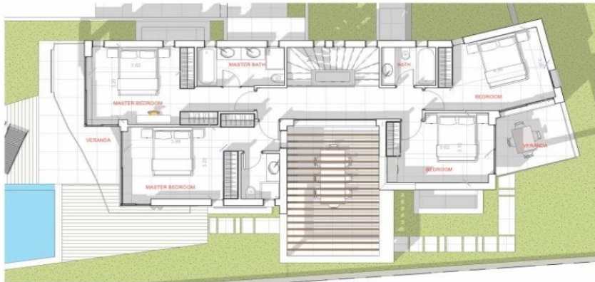
PRELIMINARY FIRST FLOOR