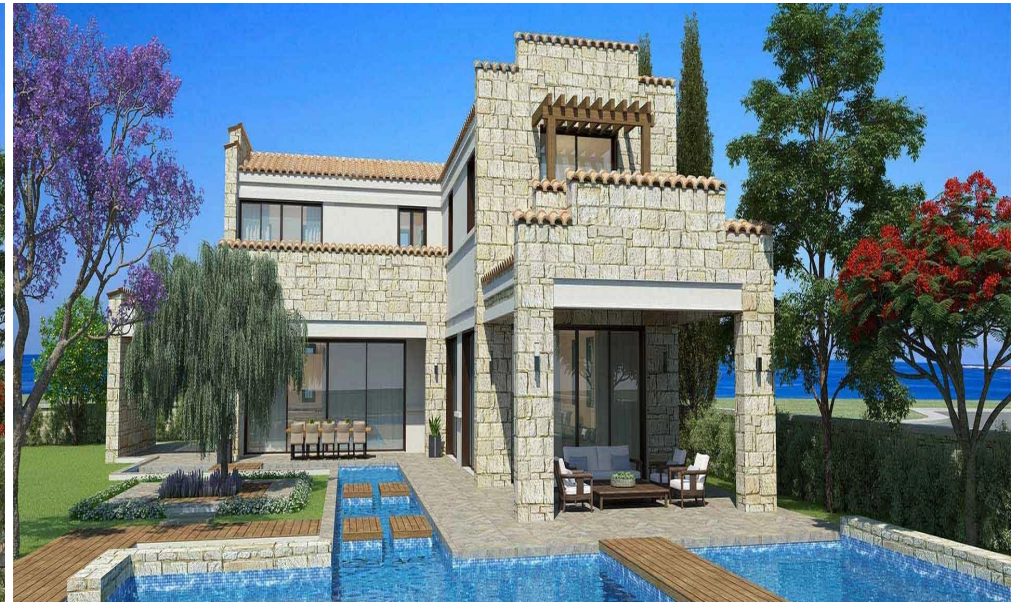
3 BEDROOM VILLA