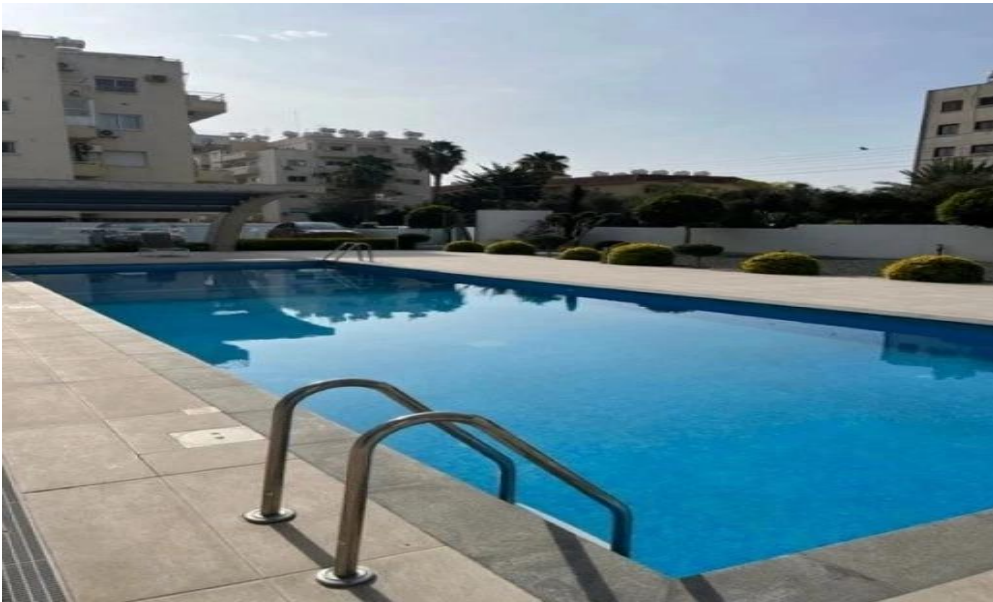
4 th Floor