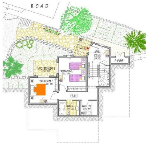
PRELIMINARY FIRST FLOOR