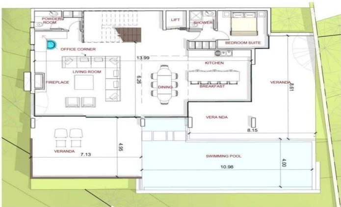
PRELIMINARY FIRST FLOOR PLAN