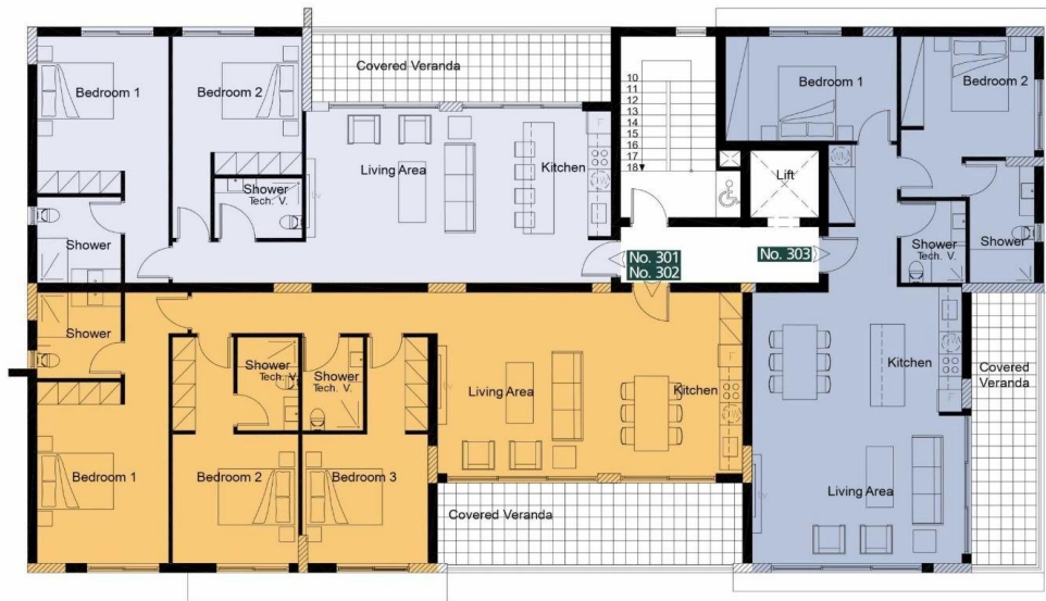
BLOCK A GROUND FLOOR