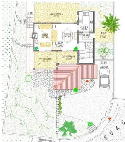
PRELIMINARY FIRST FLOOR