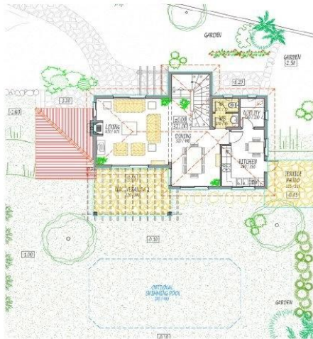
PRELIMINARY FIRST FLOOR