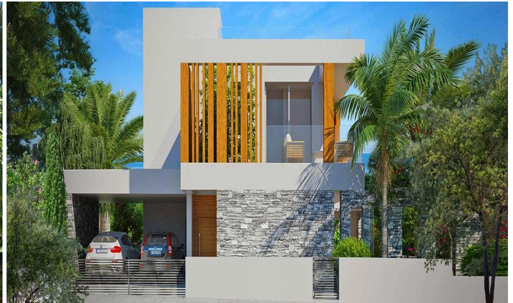
5 BEDROOM VILLAS