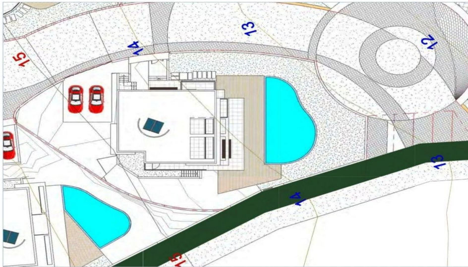
PRELIMINARY SITE PLAN