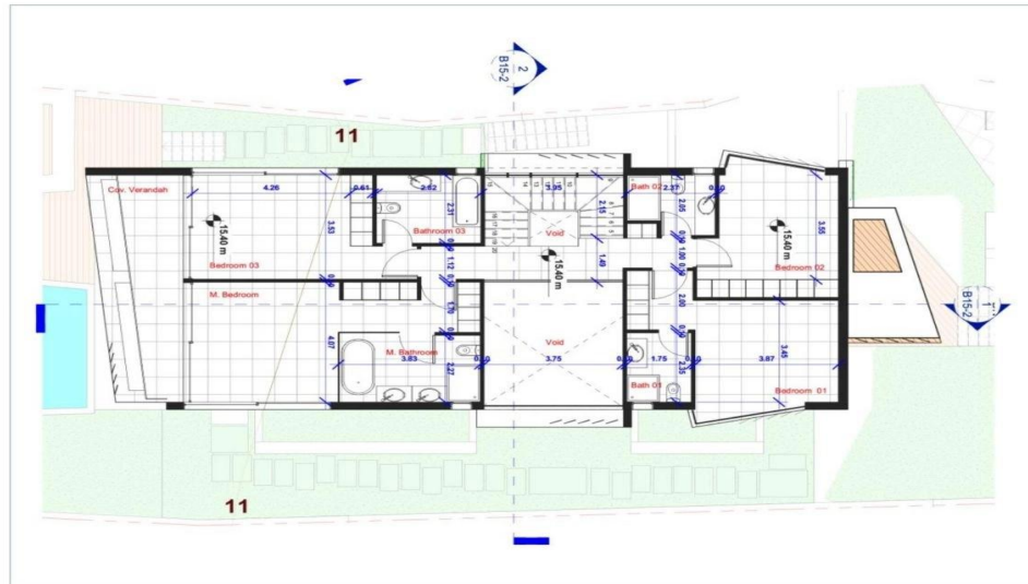
PRELIMINARY FIRST FLOOR PLAN