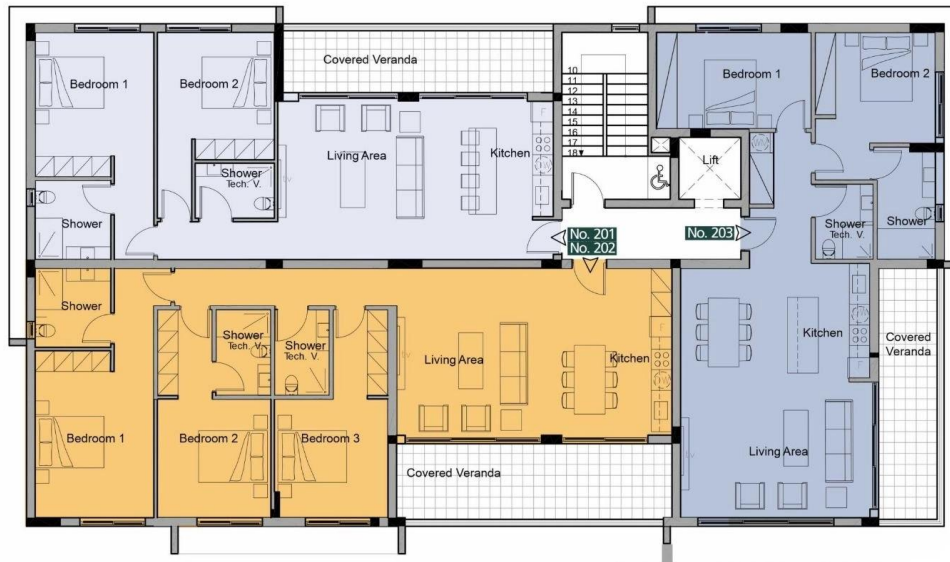
BLOCK A GROUND FLOOR