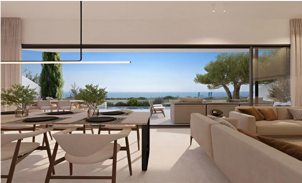
VILLAS 1 – 7 THREE-BEDROOM VILLAS