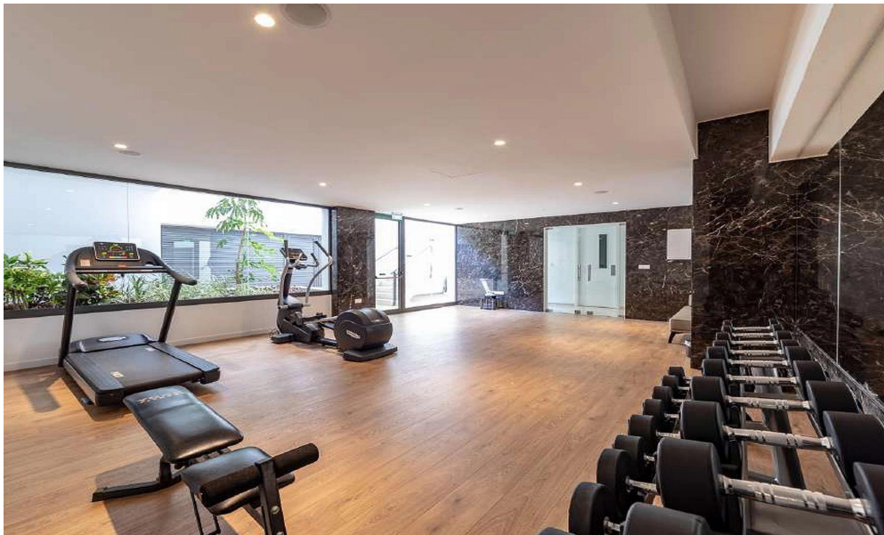
block A apartment A401