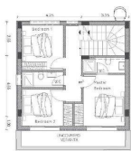
FIRST FLOOR LEVEL