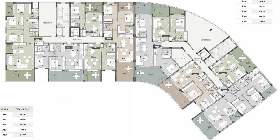
• block b