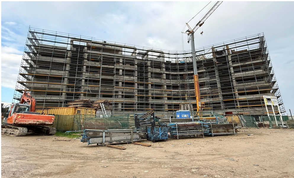
block B apartment 302