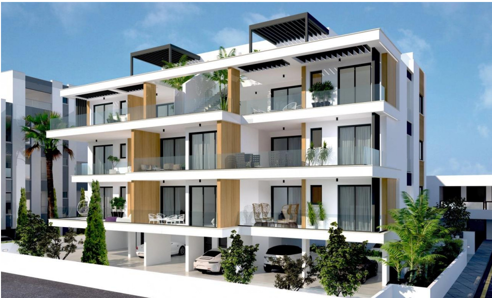
3 rd Floor