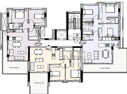
BLOCK A - B