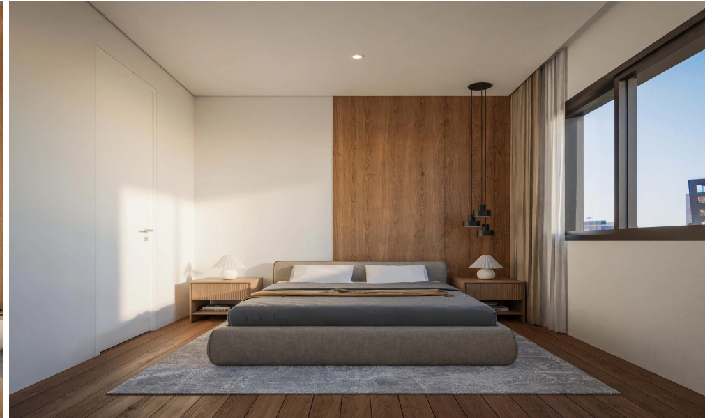
First & Second Floor