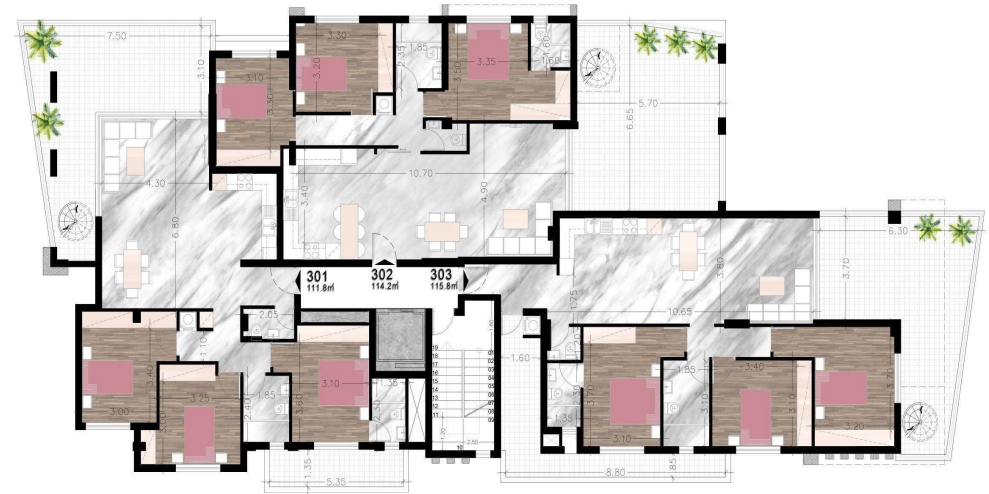
3rd FLOOR PLAN