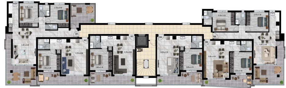
3 rd FLOOR