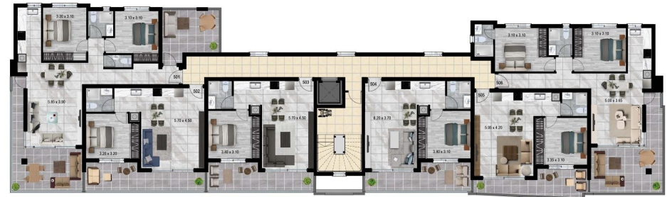
5 TH FLOOR