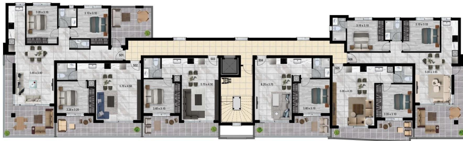
5 th FLOOR