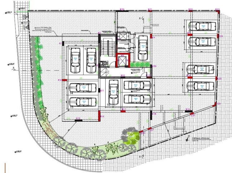
1st & 2nd Floor