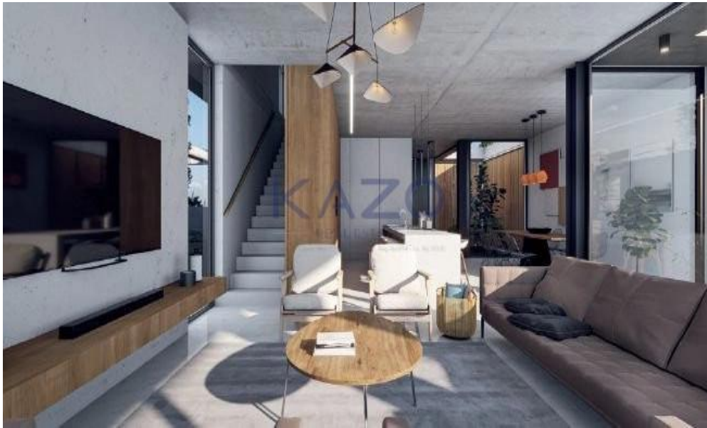
TYPE A 1207BIO GROUND FLOOR