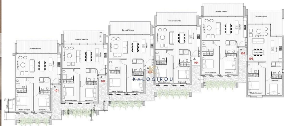
K B FIRST FLOOR