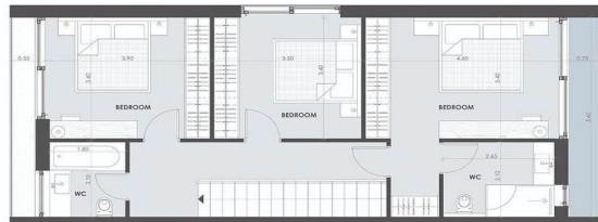
■ 1ST FLOOR