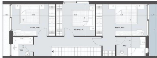
■ 1ST FLOOR