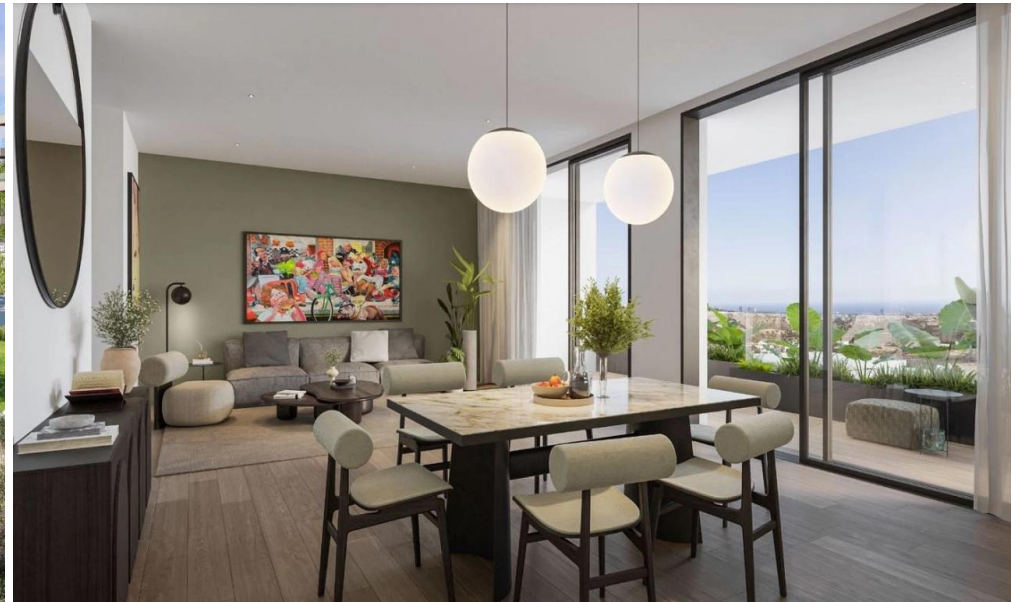
2 Bedroom Apartment