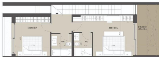
■ 1ST FLOOR