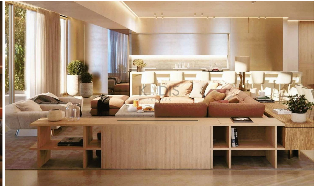
4 BEDROOM DUPLEX APARTMENT FLOORS: BEACH | GROUND